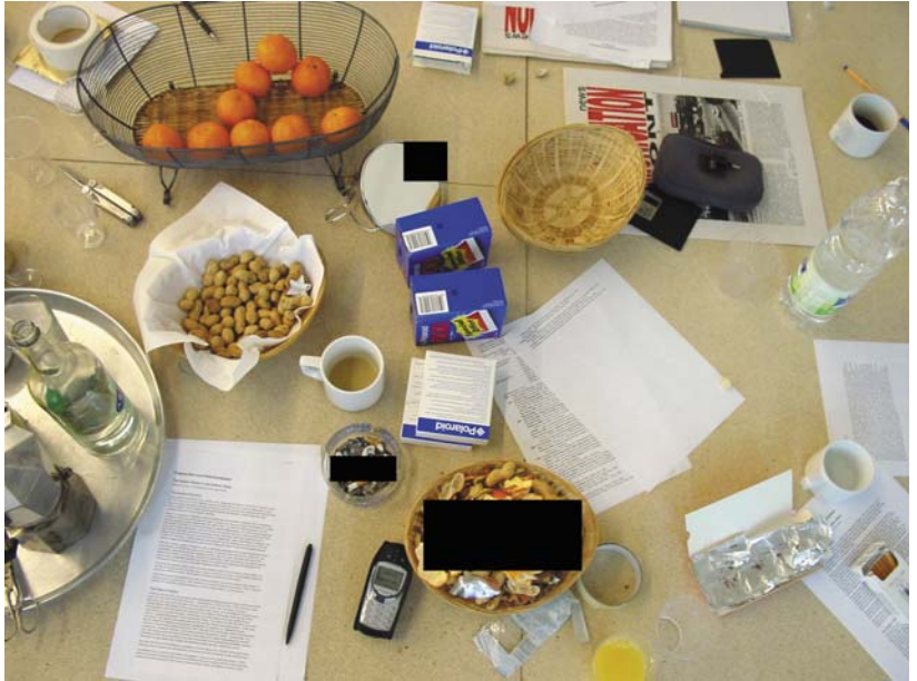
... polaroid poll actionN