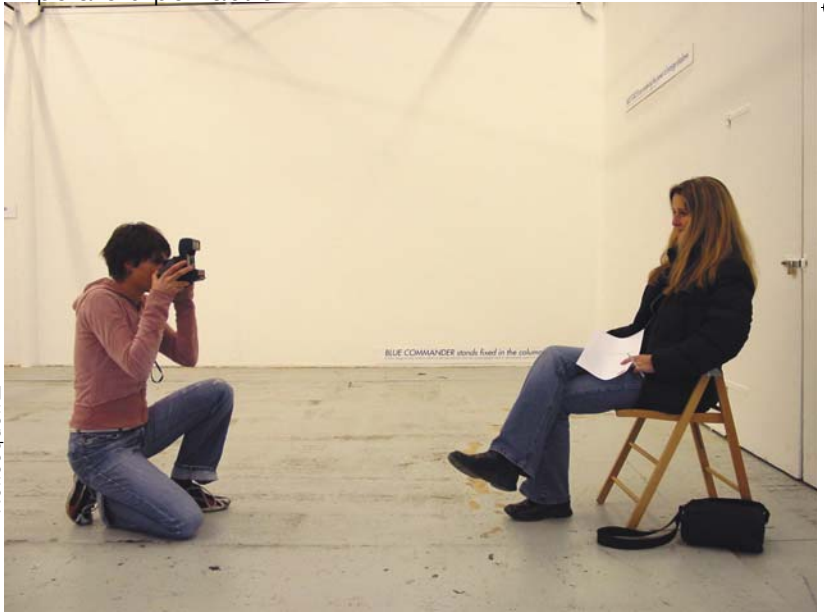
Alice in action