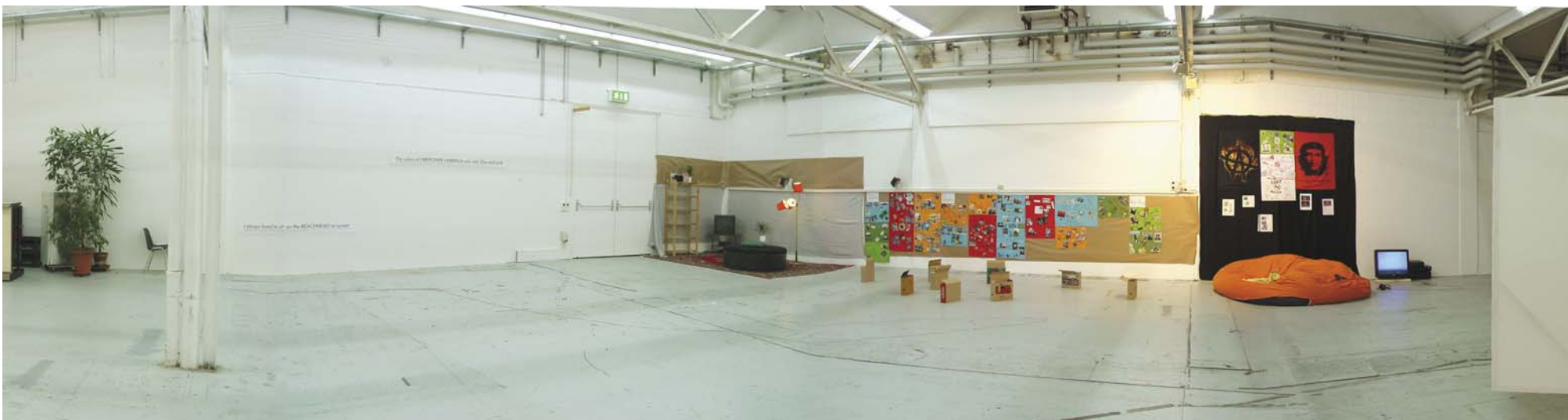
20 BLUE COMMANDER stands fixed in the columns of the sun

Those forces used to oppose both blue and orange forces in NATO exercises. This is most usually applicable to submarines and aircraft. See also force(s).